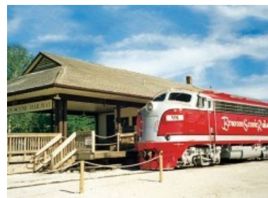
Branson Scenic Railroad $28.25