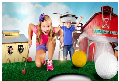
Fun Spot Farm Mini-Golf $8.95