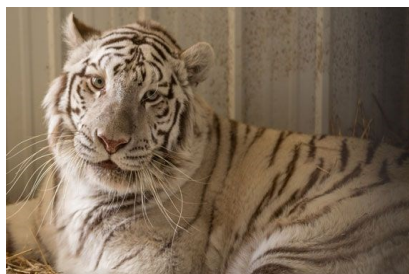
National Tiger Sanctuary $25.00