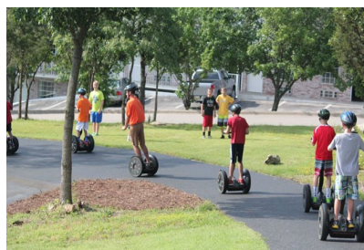
Branson Segway $18.91