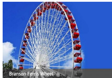
Ferris Wheel $10.75