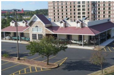
History of Fishing Museum $16.08