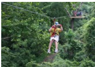
Branson Zip Line Wolfe Mountain—$99.99 Zip line USA—$89.00