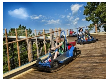
Track Family Fun Parks $43.01 (4 rides)