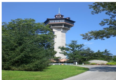
Shepherd Inspiration Tower $8.25