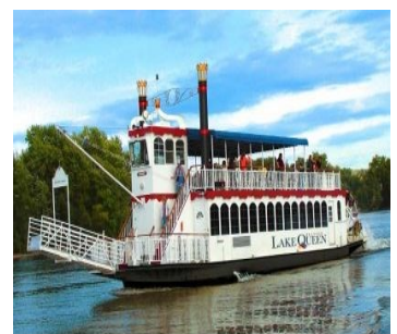
Main Street Marina