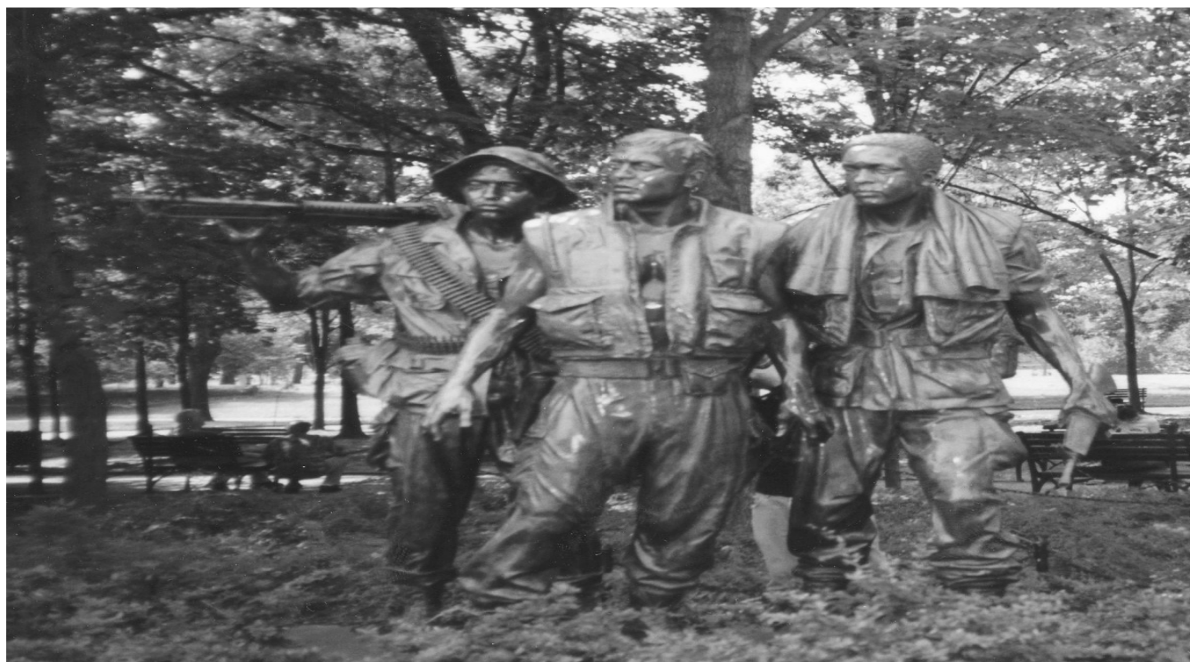
VIETNAM VETERANS MEMORIAL. WASHINGTON, DC