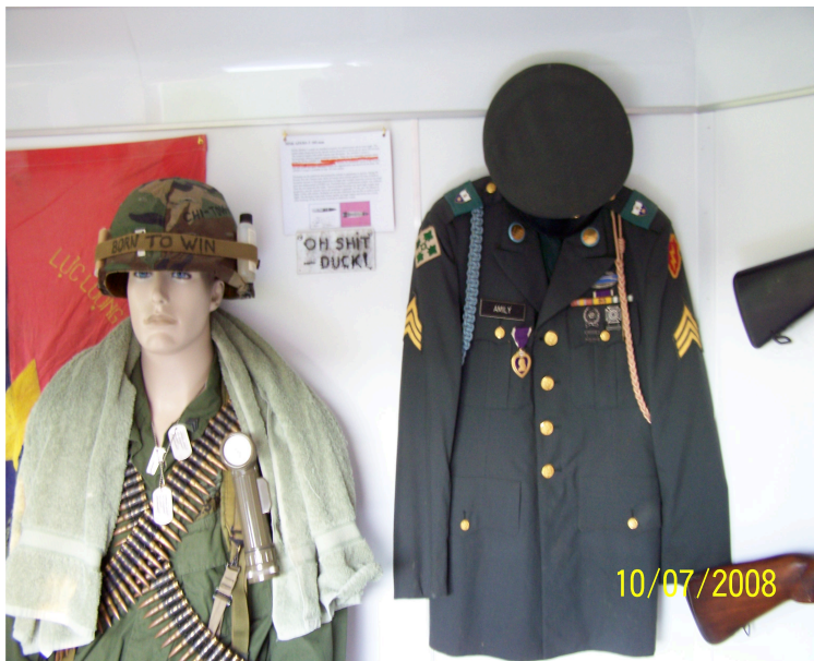
Denny's Combat & Dress Uniforms