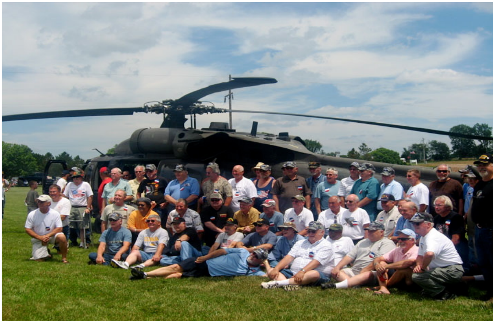
2010 Reunion attendees gathered for Blackhawk Static Display by the Missouri Army National Guard