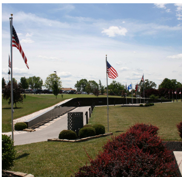
The Wall That Heals, Altoona, PA