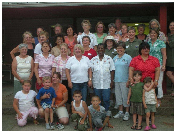
The lovely ladies of Bravo Company with A few grand kids thrown in, at the 2008 Reunion